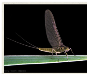
Large Dark Olive