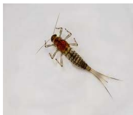
Dark Olive Nymph