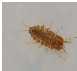
Water Hog Louse