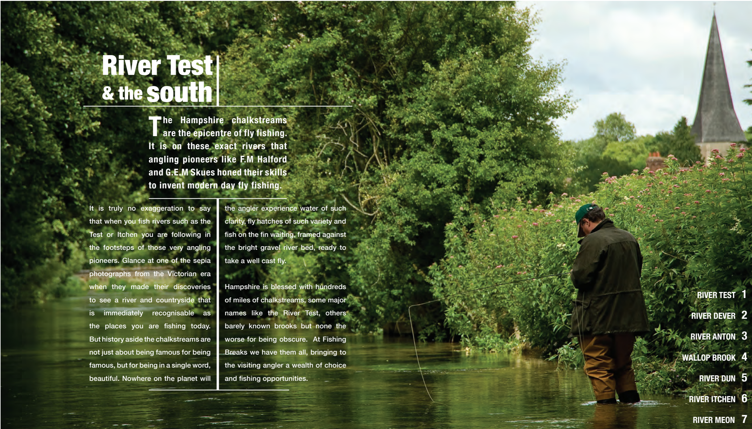
RIVER TEST, WHITCHURCH FULLING MILL, HAMPSHIRE

Hampshire is blessed with hundreds of miles of chalkstreams, some major names like the River Test, others barely known brooks but none the worse for being obscure. At Fishing Breaks we have them all, bringing to the visiting angler a wealth of choice and fishing opportunities.