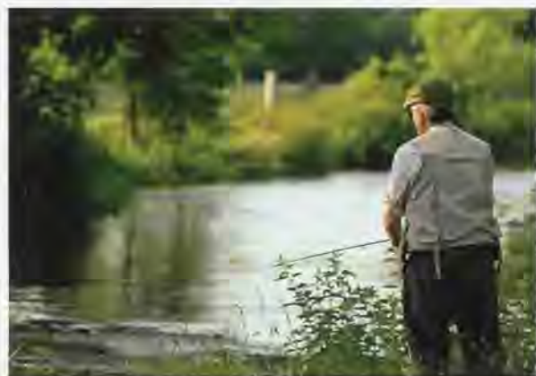
The confluence of the rivers Test and Bourne (above) is as close to angling perfection as it gets

Contact Simon Cooper, Fishing Breaks, tel 01264 781988.