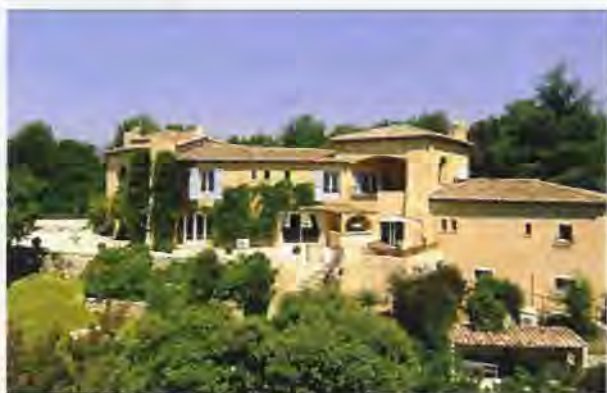
Not a bad alternative: a villa in Valbonne (above)