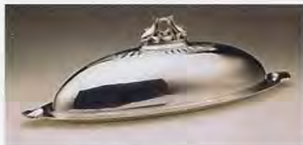
Dish up fish with silverware (above) that combines beauty, form and function - as it should for the price