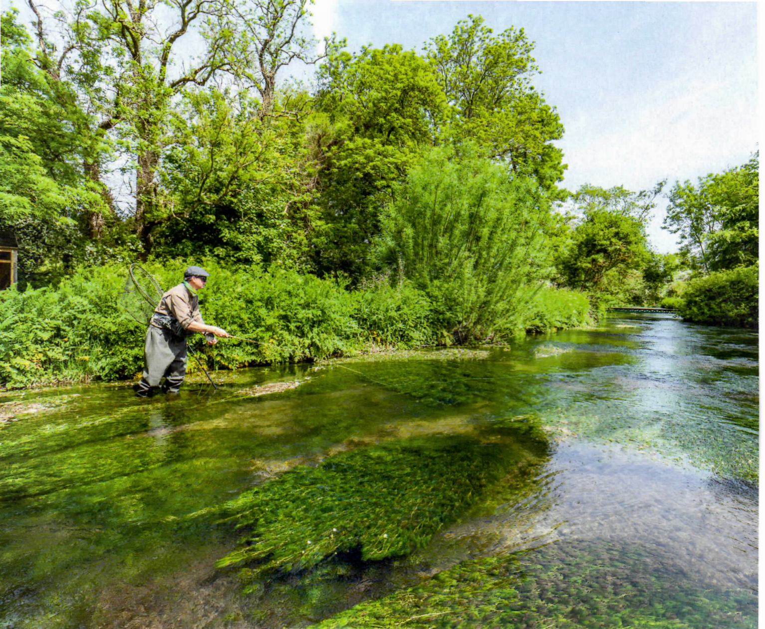
ABOVE Working a dry-fly between the weedbeds on the captivating Meon.

and the Duster. On the Meon, and because its looped mallard wing makes it easy to see, I initially put up a size 16 John Storey.