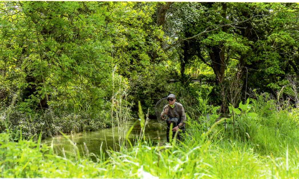
ABOVE Avoiding lurking greenery.

trout and their habitats. Rivers could only sustain so many fish of such an average size and in those days an average Wharfe trout would have been 8oz-12oz. Those of us who then fished the Dales rivers had what I think were reasonable expectations. A pounder was a good fish, a two-pounder the fish of a season. To catch a four-pounder would have been like lassooing a gorilla in a flower-bed.