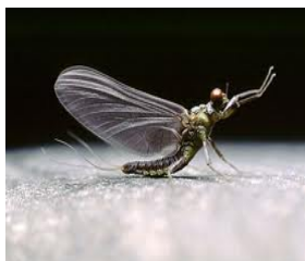
Blue Winged Olive