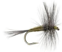
Blue Winged Olive