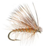
Elk Hair Caddis

Cinnamon Sedge 10-12 Elk Hair Caddis 14 Caperer 12-14 Goddard Caddis 12-14 Grey Klinkhammer 12-14 (Emerger)